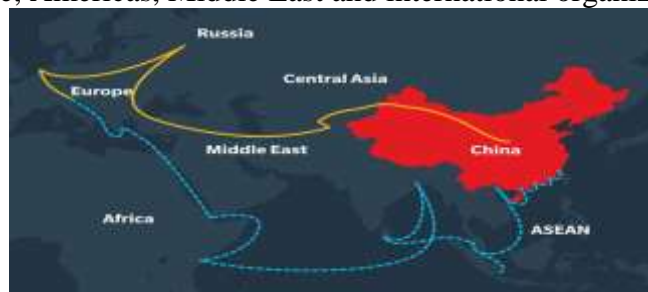
Figure 1. The energy infrastructure in Asia, Africa, Europe, Americas, Middle East and international organizations 1 .

“Silk Road” is 2000 years old project that is well known as the “Belt and Road Initiative” (BRI). Impact, Belt and Road Initiative is a Chinese initiative for global development in which included industrial zones, communication infrastructure, the energy infrastructure in Asia, Africa, Europe, Americas, Middle East and international organizations.