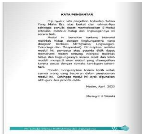
Figure 2. Introduction of E-Module Learning

The word of introduction contains gratitude to God Almighty who has bestowed his gifts and guidance so that the writer can complete the writing of this learning module in a timely manner. The next greeting is given to all parties who help.